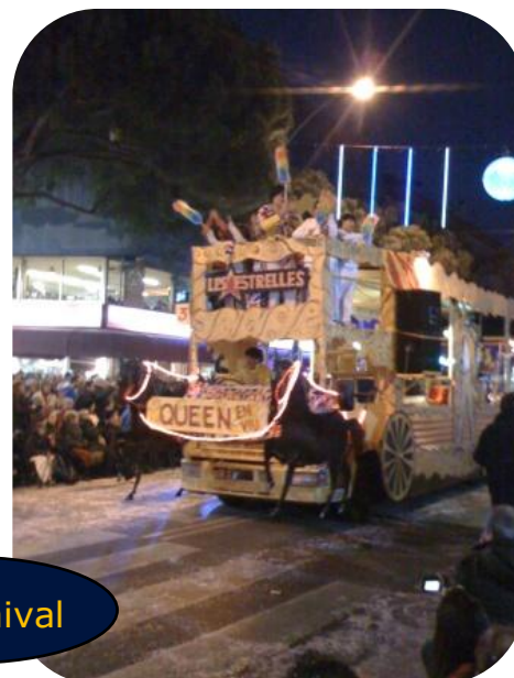
Les Estrelles go live with Queen at the Carnival