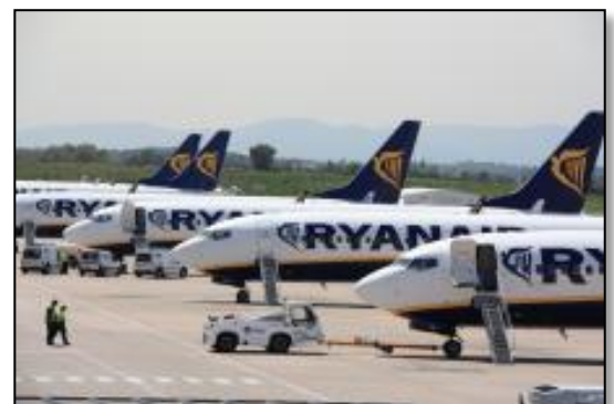
Ryanair: Ready for take-off

It is already possible to book flights in June, July and beyond to all key destinations including the UK, Netherlands and Germany as the threat of having to return to the Barcelona airways is removed from the agenda.