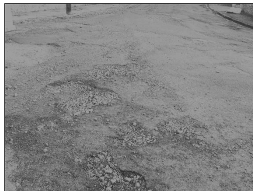
Do we really want this.....

Heavy voting by mail and email and a well attended meeting are therefore essential. It seems all too apparent from comments made to The Perch that the majority of Cabanyes' proprietors record of apathy and inertia must end. It is time for all concerned to stand up and be counted. The Association is a must.