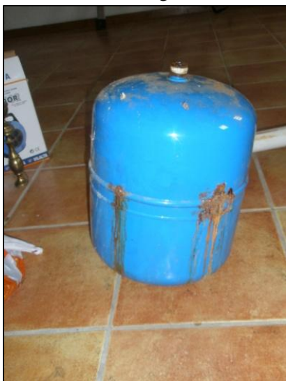
Corroded expansion tank

So we have now discovered the hard way that it is advisable to turn the water off to the house using the external stop-cock. Our villa has two - one in the road by the meter, and another in the drive. The advantage of the latter is that it will isolate the house water, but leave the irrigation and swimming pool unaffected.