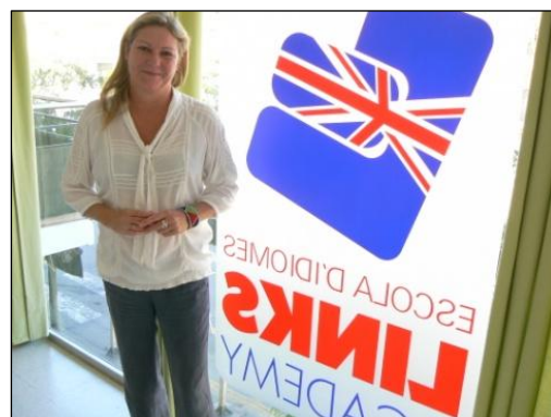
Making sense of language from every perspective