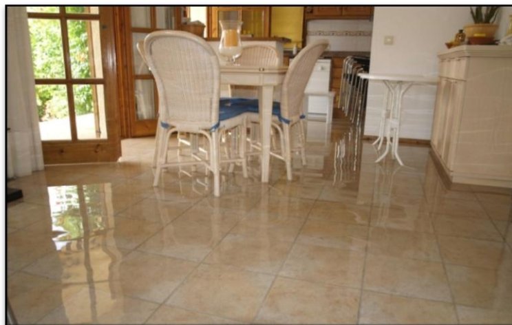
Walk on Water?

The source of the flood was a small tank adjacent to the boiler; the expansion tank. Its function is to protect closed water heating and domestic hot water systems from excessive pressure. But it had corroded and eventually perforated. It is apparently connected direct to the mains water supply, and given the pressure here at the lower part of Cabanyes, had spewed out water with considerable force for some hours. The fact that we had turned off all the internal stop-cocks did not help, and I have to admit, I thought (perhaps naively) that as the boiler and heating were turned off, there would be no question of water flowing around the system.